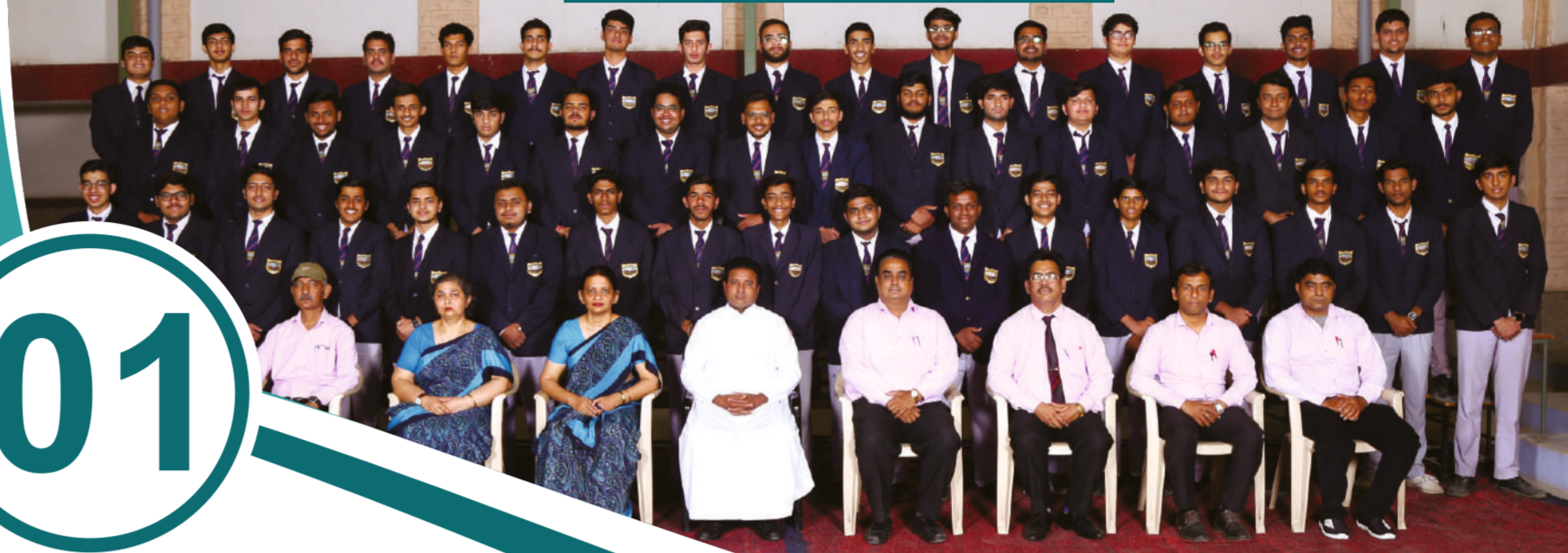
XII-Commerce Batch 2021-22