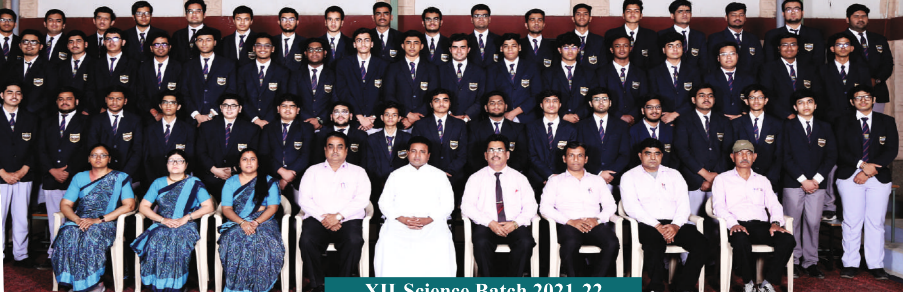
XII-Science Batch 2021-22